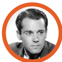
Henry Fonda CHS 1923

Received Academy Award for Best Actor in 1981 and has a star on the Hollywood Walk of Fame