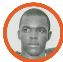
Gale Sayers CHS 1961

Former running back for the Chicago Bears in the National Football League who is enshrined in the Pro Football Hall of Fame