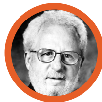
Alan Heeger CHS 1953

Awarded the Nobel Prize in chemistry in 2000 for "the discovery and development of conductive polymers"